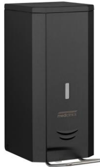
DJSP0036B Black finish