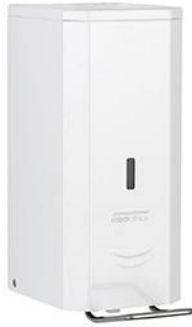
DJSP0036 White finish