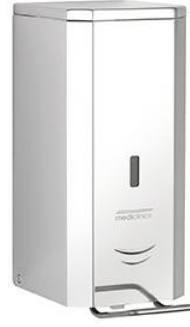
DJSP0036C Bright finish