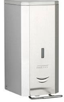
DJSP0036CS Satin finish